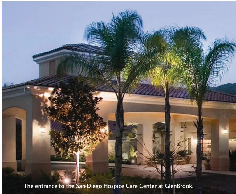
The entrance to the San Diego Hospice Care Center at GlenBrook.

Each of our six semi-private rooms has a garden view. Every patient gets an individual television and if space allows, private rooms are available for an additional fee.